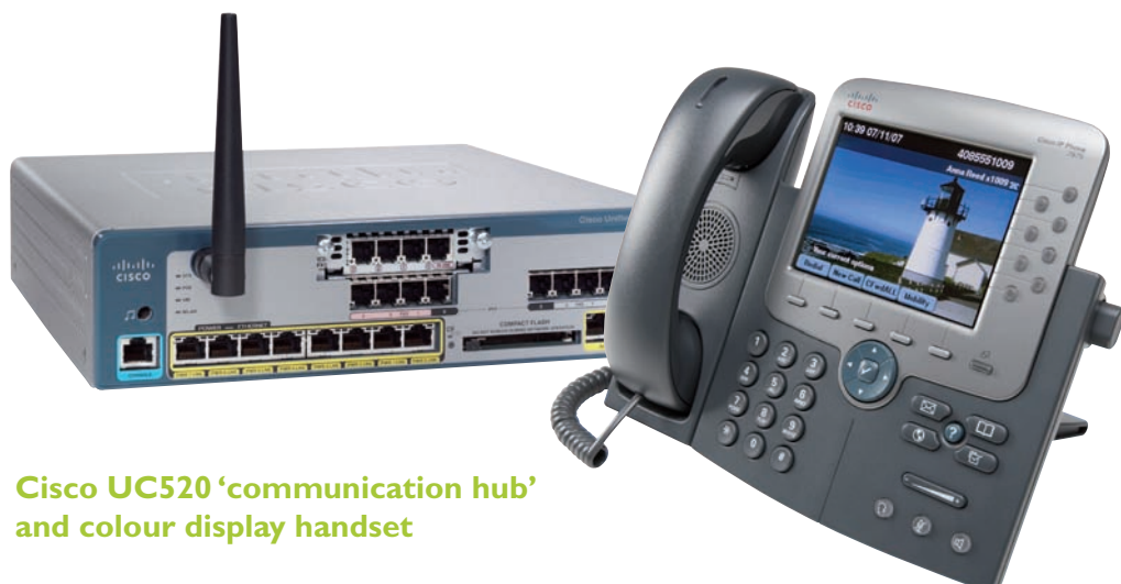
Cisco UC520 ‘communication hub’ and colour display handset

The GCC innova business-needs analysis recommendation consisted of BT ISDN digital communication lines together with a Star business internet lease line hooked up to a Cisco UC520 ‘communications hub’. The system comprises integral firewall, router, telephony solution and WiFi capability. Initially, eight user extensions have been provided with a mix of Cisco monochrome and colour display handsets, plus a fax handling facility. In addition, a GSM mobile gateway was specified to take advantage of low / no cost mobile call charges (within group and cross-net). The complete system was installed over a period of two days with no business disruption.